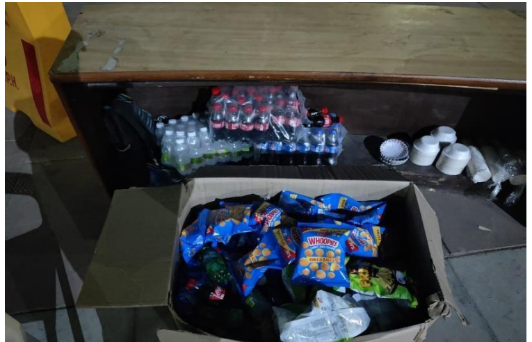
Figure 3(D). Refreshments for dignitaries and student

The Sports Council had made arrangement of refreshments for both students and dignitaries. After a 3-3 thriller across 120 minutes, Argentina bested France 4-2 on penalties to win their third World Cup, after 36 years with this the event of the day came to an end at 11.30 PM bringing joy on the faces of their fans.