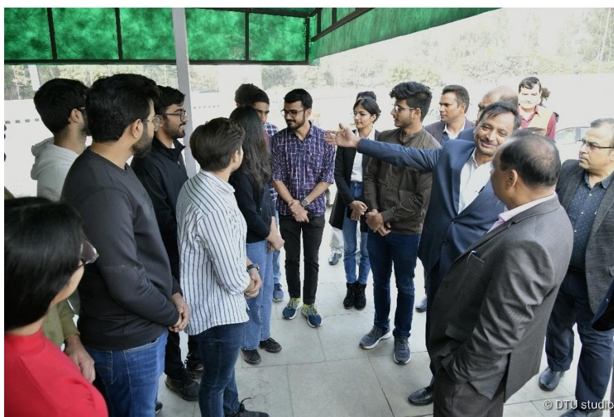
Figure 2(C). Hon'ble Vice Chancellor addressing the students

Hon'ble Vice chancellor and the registrar addressed the gathering and enlightened the sports council members about the latest development of the universities for the benefit of students. The program was concluded with refreshment and student interaction followed by photography session.