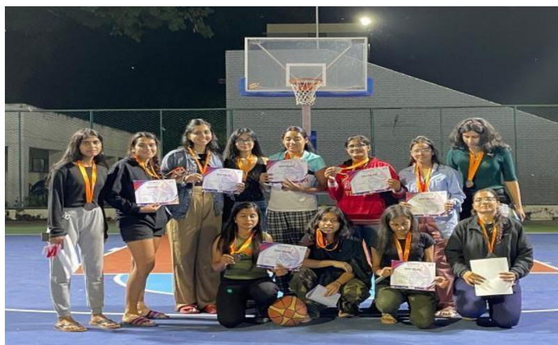
Figure 1(C). DTU Basketball (girls) team with medals and certificates

DTU Basketball (Girls) secured BRONZE in UDGHOSH 22.