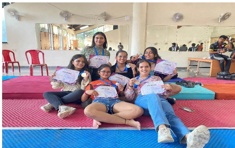
Figure 1(F) Kabaddi (Girls) team with medals and certificates