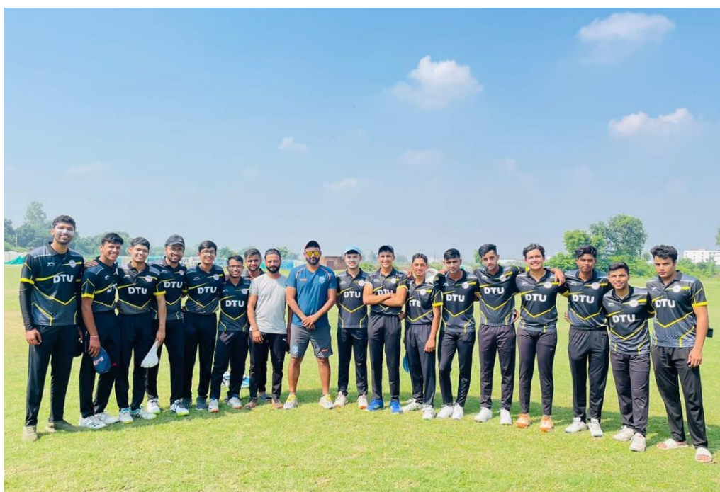
Figure8(C). DTU's cricket team