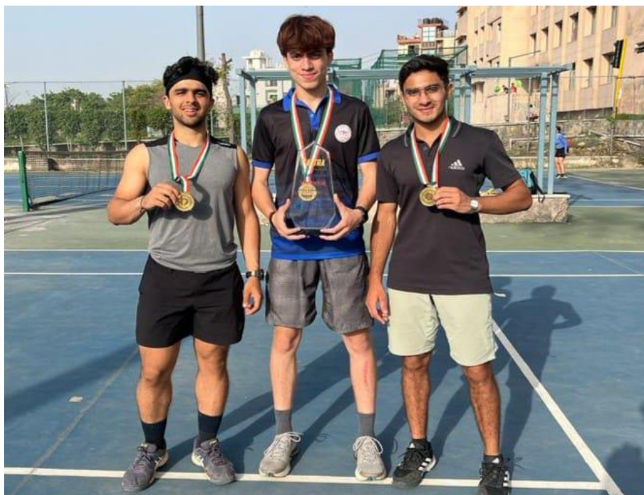
Figure 8(D). Lawn Tennis (boys) with medals.