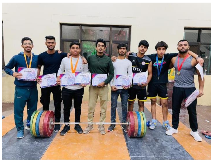
Figure 1(H). DTU Weightlifting and powerlifting team with certificates