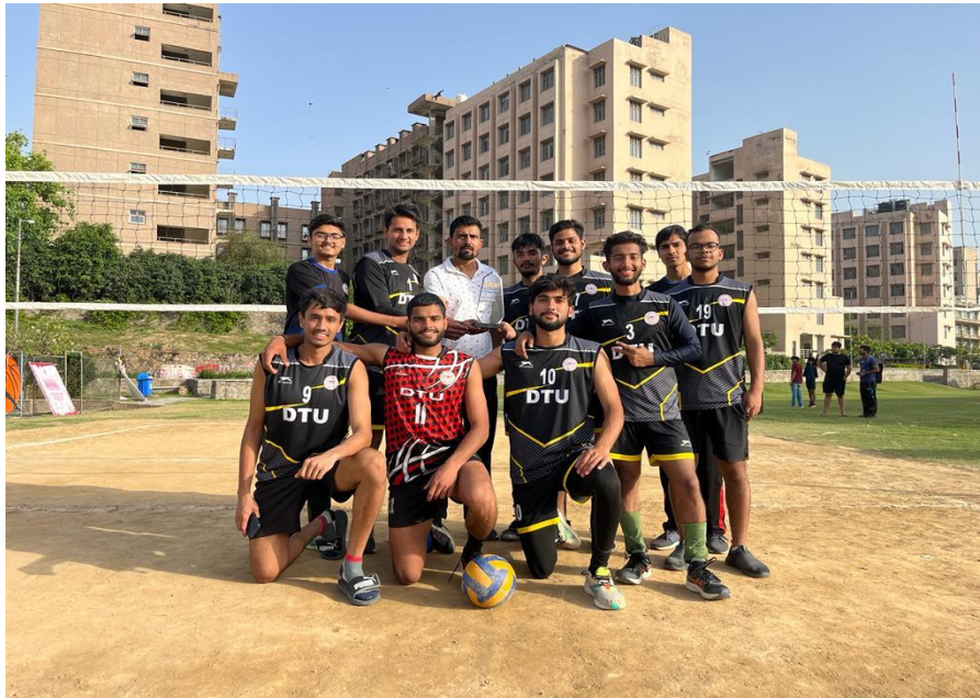
Figure 8(E). DTU's volleyball team.