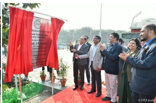
Figure 2(B). Hon'ble Vice Chancellor with other dignitaries