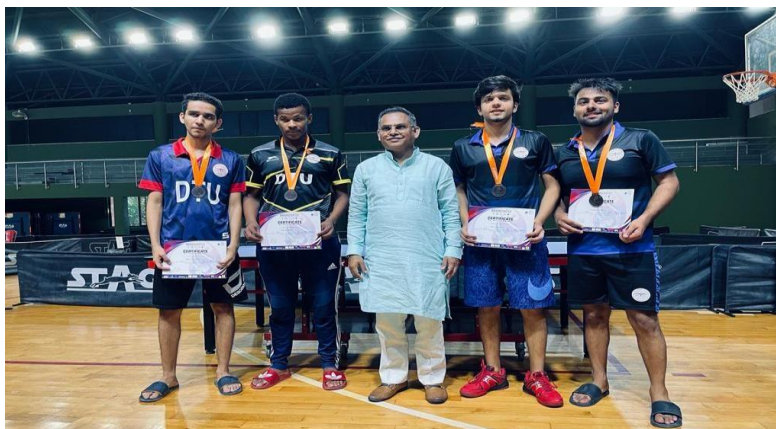
Figure 1(G) Table Tennis (Boys) with medals and certificates

DTU Table Tennis (Boys) secured BRONZE in UDGHOSH 22.