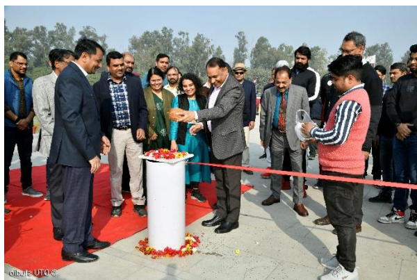
Figure 2(A). Ribbon cutting ceremony