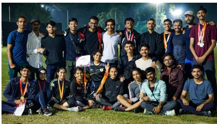
Figure 1(A). DTU Athletics Team with medals