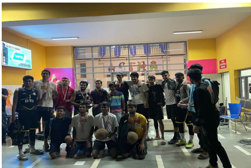
Figure 8(A). Basketball (boys) with medals