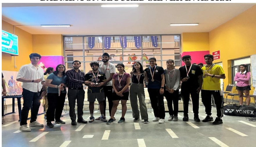
Figure8(B). Badminton team with medals.