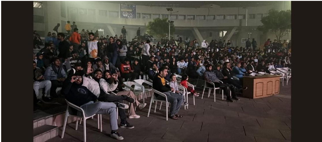
Figure 3(A). football fans watching the telecast of FIFA WORLD CUP FINAL

FIFA World cup Final Screening was held on 18 th December, 2022 . The most prestigious tournament of the world, taking place quadrennially, the FIFA Men's World Cup sees 32 nations compete against each other for the prize with continental qualification pathways leading to an exciting final tournament between Argentina and France in Qatar, which bring fans together around the passion and love for the game.