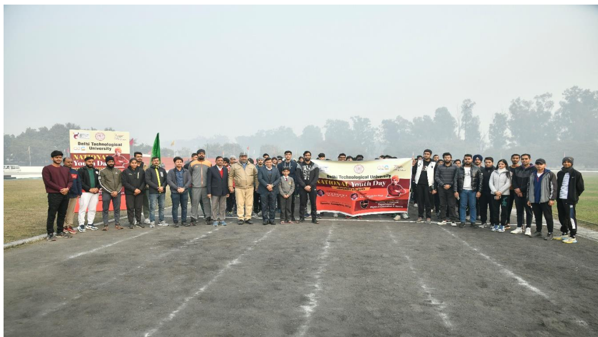
Figure 6(B). Sports Council DTU and volunteers with dignitaries.

The event had widespread participation from the students, faculty and the staff with more than 100 participants. The objective of this event was to strengthen and motivate the youth of the country and convincing them to come together in an attempt to showcase their talent in various activities. The day also talks about providing an opportunity to amateur young talents to express themselves and interact with fellow competitors to expand the horizon of knowledge and skills.