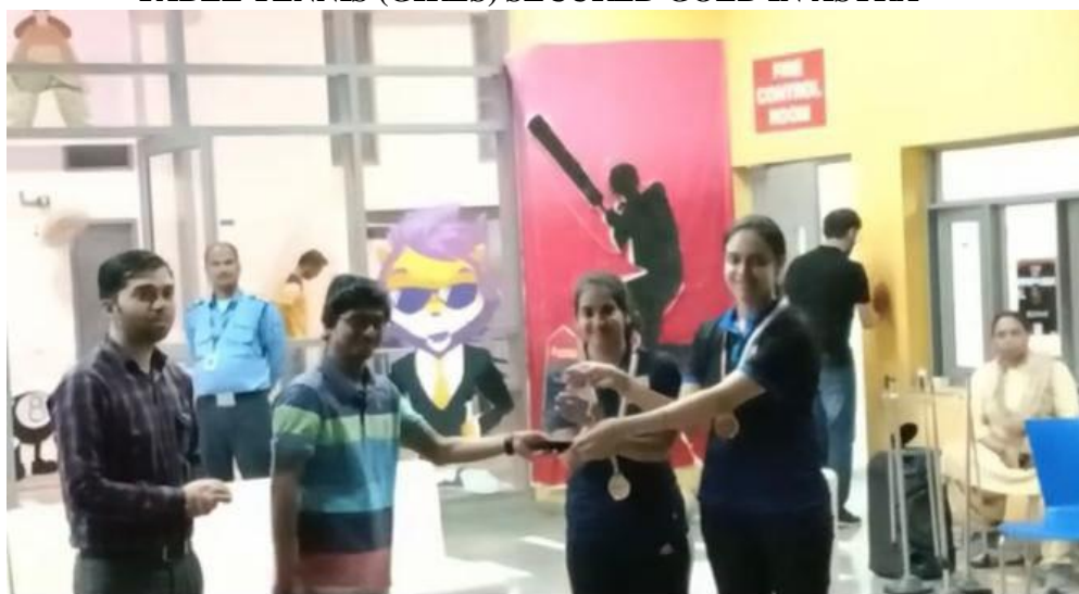
Figure 8(E). Table tennis (girls) with medals

TABLE TENNIS (GIRLS) SECURED GOLD IN ASTRA