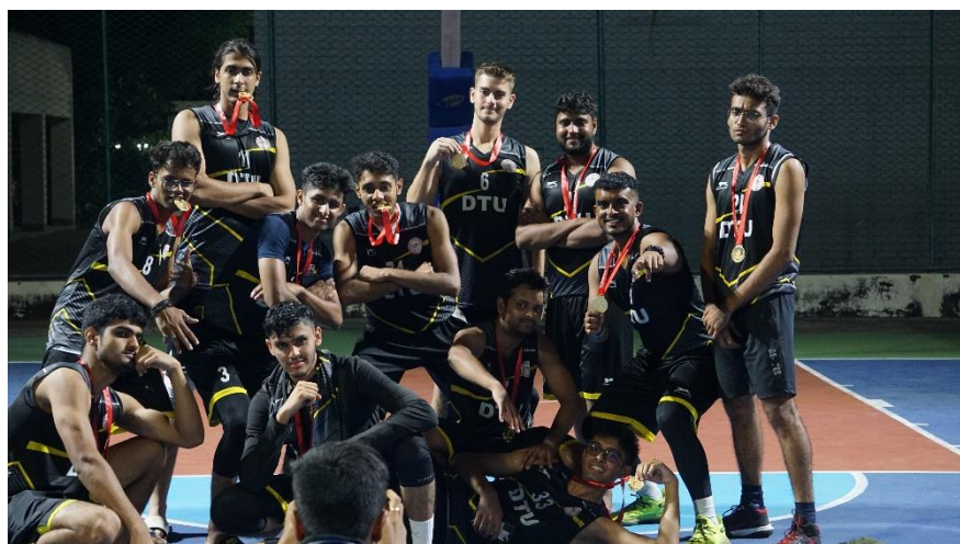
Figure 1(B). DTU basketball(boys) team with medals

DTU Basketball (Boys) secured GOLD in UDGHOSH 22.